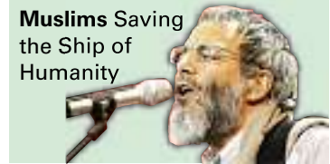
Muslims Saving the Ship of Humanity

Let's always remember this verse from the Holy Qur'an. Please be fair to your workers, treat them with respect and humility. Honor your contracts and promises. Fear Allah (STW), and win his pleasure, and that of his Prophet. That is certainly the way of the righteous.