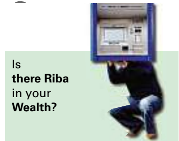
Is there Riba in your Wealth?