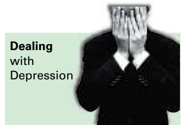
Dealing with Depression