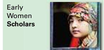
Early Women Scholars