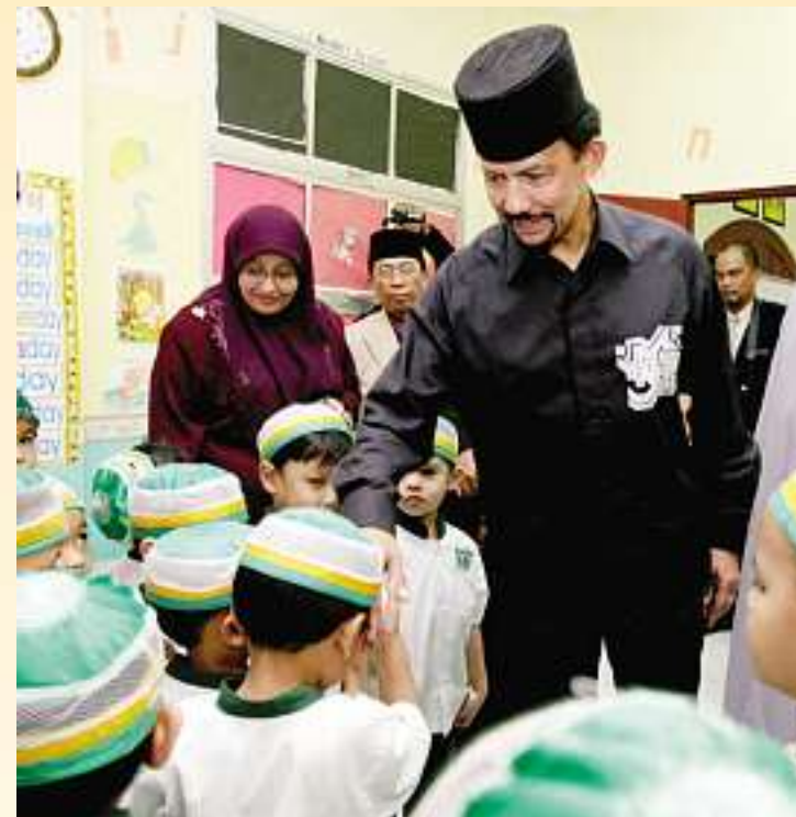
His Majesty the Sultan and Yang Di-Pertuan of Brunei Darussalam greets students during the monarch's visit to Al-Falah School at Taman Manggis, Jalan Muara, on January 26.

In a titah delivered during his a recent working visit to Seri Begawan Religious Teachers University College (Kupu SB), His Majesty the Sultan and Yang Di-Pertuan of Brunei Darussalam made a